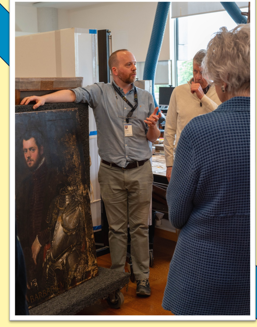
A 16th century portrait will be examined and restored over a period of time to repair older conservation efforts and make it presentable for display.

The feedback from participants has been very positive, and the planning team has already begun discussing Ideas for future tours.