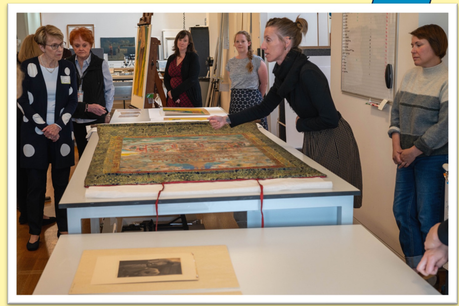
Three areas of conservation - objects, painting and paper. Here, the group see an example of the work in the paper department.