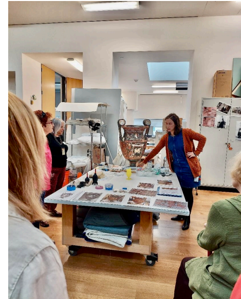
Objects Conservation Area