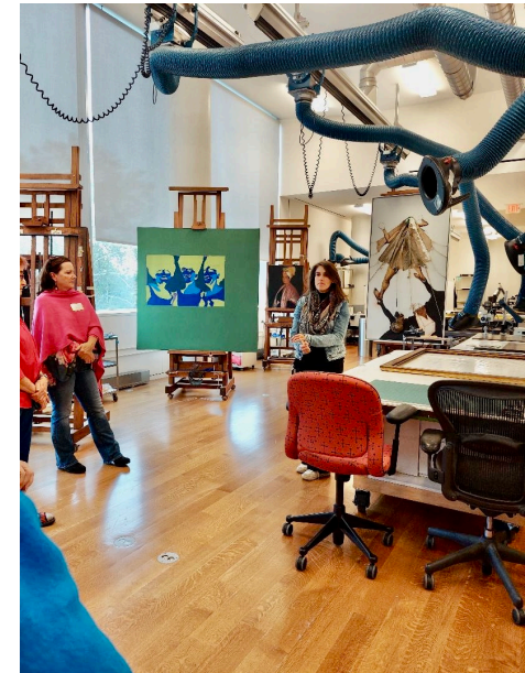
Painting Conservation Area